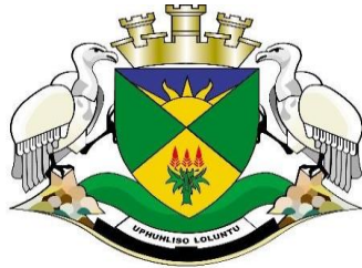
O.R. TAMBO DISTRICT MUNICIPALITY